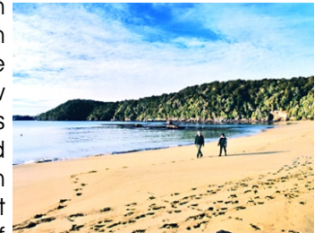
Strolling along one of Ulva Islands beautiful unspoiled beaches

New Zealand has recently recognised yet another South Island gem that epitomises everything that is special about the country. Clean air, dense green countryside, kiwi birds in the wild, and a little slice of New Zealand as it was decades ago – undeveloped and unspoilt. But by definition such places are hard to get to and you need a bit of inside knowledge to know how to organise it.